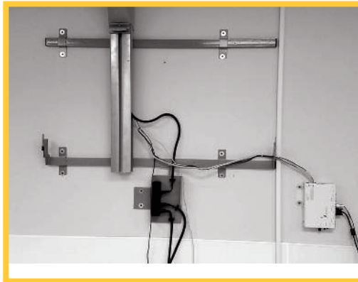
The framing and wiring for our new smartboard.