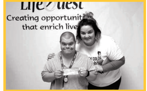
Bella's Color 5K Run/Walk benefitted LifeQuest.