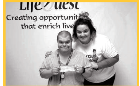
Bella's Color 5K Run/Walk benefitted LifeQuest.